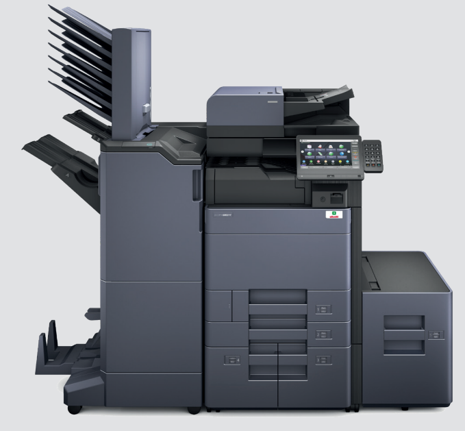
d-Copia 6001MF with DP-7110+PF-7110+PF-7120+DF-7110 +BF-730+MT-730+ NK-7120